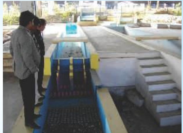
Flood sluice spillway of Hassan Dam, Yemen