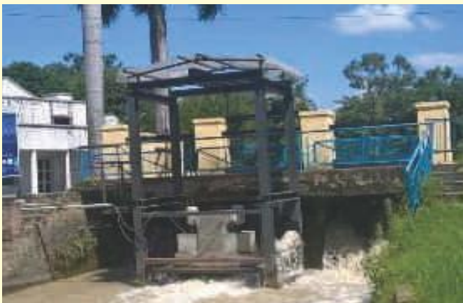
Hydraulic Research Station, Bahadarabad

As a part of UNIDO Project for promoting ultra low head – micro hydropower technology (ULH – MHP) to increase access to renewable energy for productive uses in rural India, three pilot projects of ultra low head turbines of 10 KW capacity have been installed at Hydraulic Research Station (HRS), Bahadrabad, Katapathar Canal, Ambadi Dehradun, Bahadur Canal Kaladungi, Haldwani by the UNIDO. Electricity generated at HRS, Bahadrabad is being used in the station itself. While at Katapatthar and Haldwani, it is used by the operating societies.