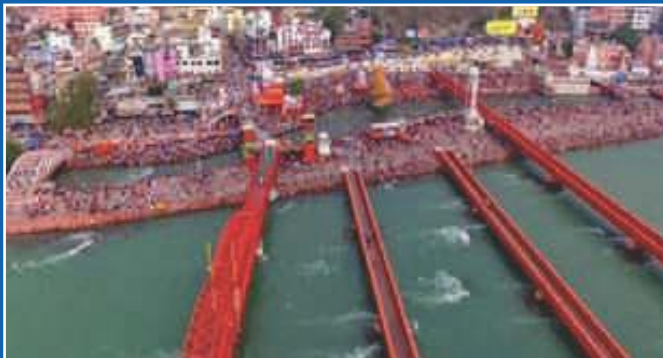
134m Shiv Dhanush Steel Bridge, Haridwar