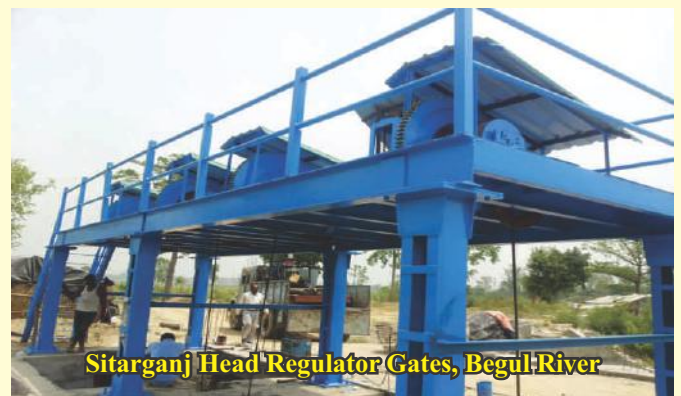
Sitarganj Head Regulator Gates, Begul River