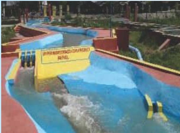
600 MW Upper Mersyangdi HEP, Nepal