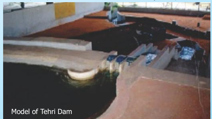
Model of Tehri Dam

Hydraulic model studies for the prestigious 260.5 m high Tehri Hydro Power Project were performed at Hydraulic Research Station (HRS), Bahadrabad for more than 25 years (from 1975