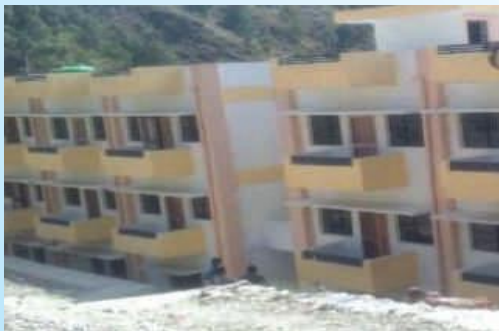
Kaushal, Thauldar, 185.85 Lac