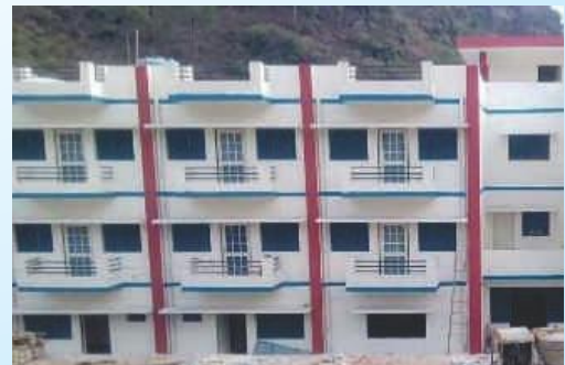
Tuini, Dehradun 186.11 Lac