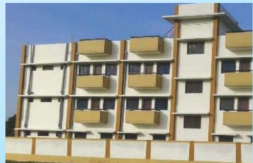
Bandiwala, Haridwar 176.05 Lac