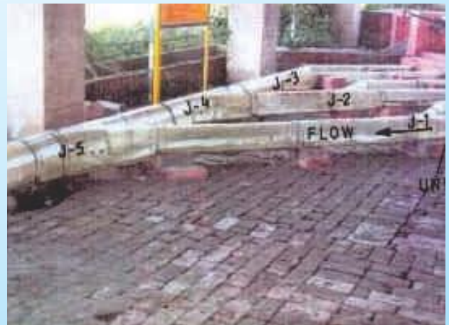
Water Conductor System of Tala HEP, Bhutan