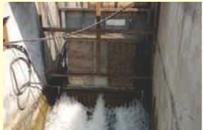
Katapathar Canal, Ambadi, Dehradun.