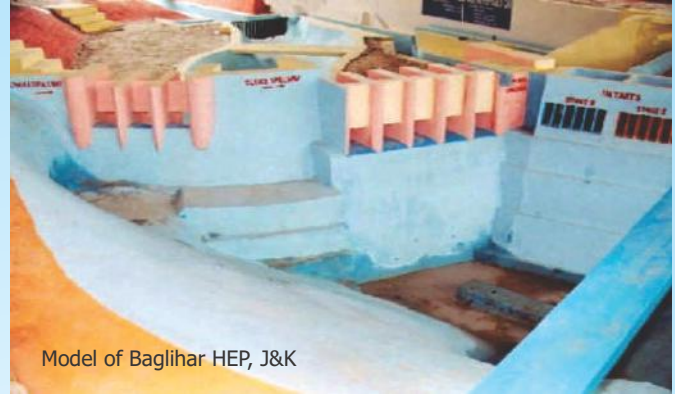
Model of Baglihar HEP, J&K

Hydraulic model studies for Baglihar HEP (450 MW), Jammu & Kashmir were conducted at HRS, Bahadrabad. These model studies proved to be very helpful in settling the issues between India & Pakistan because of objections raised by Pakistan. Outcome of the model studies at the station have been appreciated by the neutral expert from World Bank and delegation from Pakistan. Delegation from Pakistan and Neutral Experts from World Bank also visited the Hydraulic Research Station, Bahadrabad.