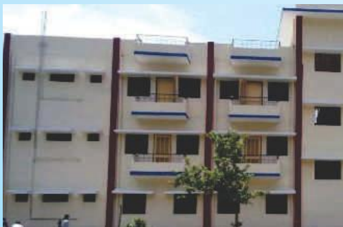
Kalsi, Dehradun, 175.9 Lac