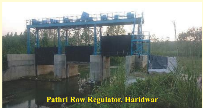
Pathri Row Regulator, Haridwar