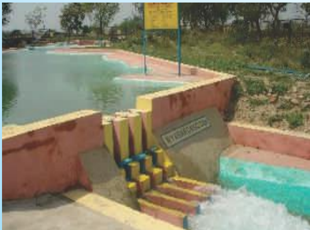
Nyabarongo HEP, Rwanda