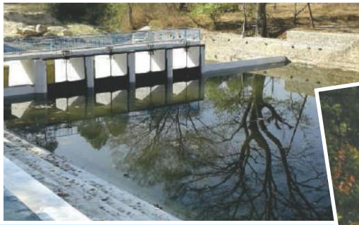
Devat Jheel, Pithoragarh

27m wide Bimandeshwar Jheel was constructed by the Department.